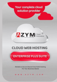
Cloud Web Hosting "Enterprise Plus Suite"

Ideal for Companies that looking to take their business to the next level by utilizing advanced E-Commerce website for selling products online with Credit Card Payment, E-Commerce Mobile Application -iOS, Android, Managed Digital Marketing, Enterprise Grade Email -Including Chat, Video Call and Cloud Storage)