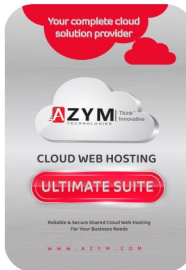
Cloud Web Hosting "Ultimate Suite"

A Complete Cloud Web Hosting Suite Designed for your Business Needs. ( Ideal for Companies that looking to take their business to the next level by utilizing advanced E-Commerce website for selling products online with Credit Card Payment, E-Commerce Mobile Application -iOS, Android, Managed Digital Marketing, Enterprise Grade Email with Unlimited Email Accounts and Space -Including Chat, Video Call and Cloud Storage)