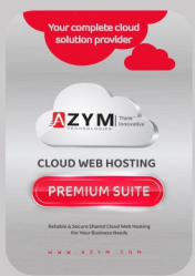
Cloud Web Hosting "Premium Suite"

Designed for your Small and Medium Business Needs. ( Ideal for Small and Medium Companies that looking to take their business to the next level by utilizing advanced Company Website, Managed Digital Marketing, Professional Email -Including Chat, Video Call and Cloud